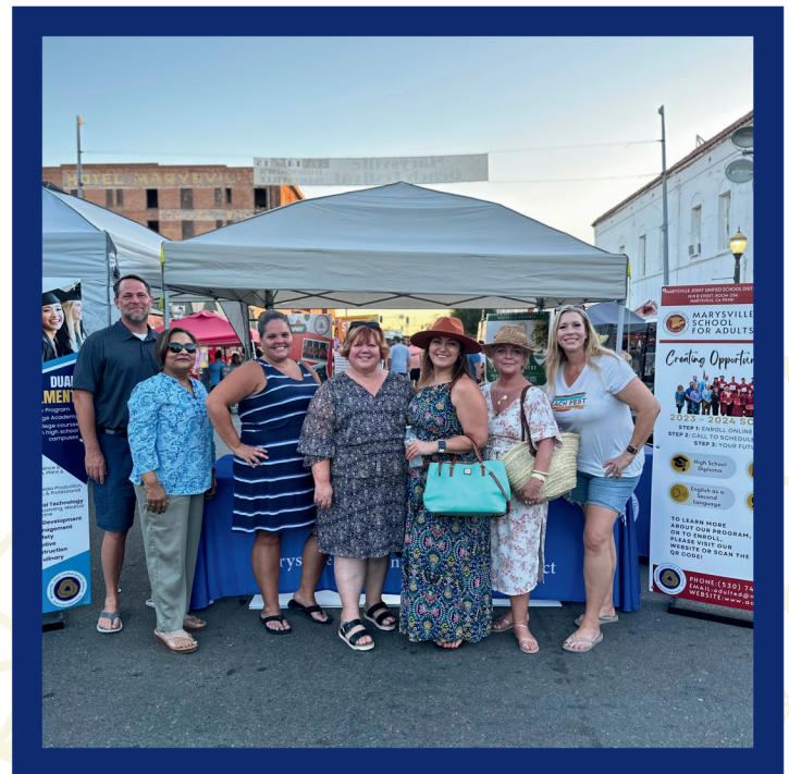
Several members of our team braved the heat to showcase our top ten programs at the 22nd Annual Marysville Peach Festival in July.