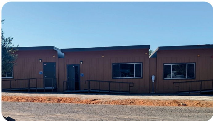
Portable classrooms have been placed at Foothill School, providing a learning space while the school is being modernized.