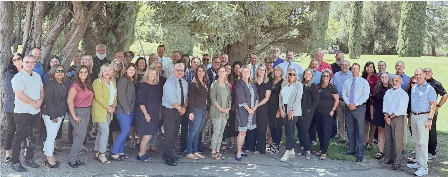
School site administrators and District leadership participated in a two-day training to prepare for students to return to campus.