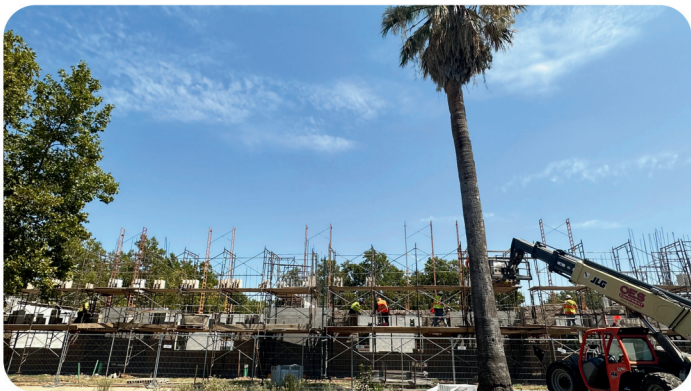
Construction of the new 16-classroom building at Covillaud School is moving quickly and expected to open to students in December 2024.

No rest for the Buildings & Grounds Department this summer! We are popping with projects. Here are just a few highlights: